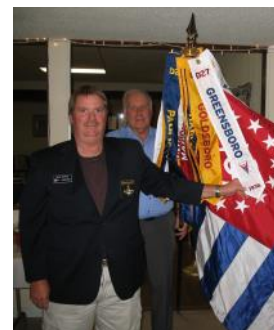
Greensboro ribbon attached