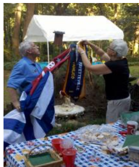
Fayetteville ribbon being attached

I've really appreciated the energy and enthusiasm I've seen in the people and squadrons in D27. Keep up the good work. We still have the exciting Change of Watch season coming up. I hope you all had a great Thanksgiving and will enjoy a wonderful Christmas and New Year. Thank you all for everything you have done.