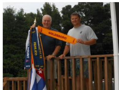
Goldsboro ribbon attached