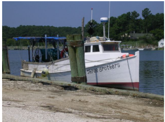
A WORKING CHESAPEAKE DEADRISE FISHING BOAT