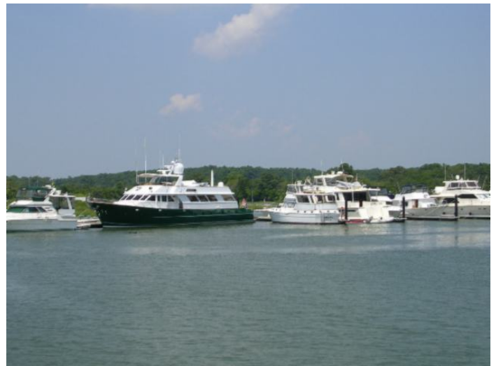
SOME MEMBERS BOATS