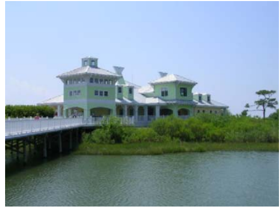
DOCK MASTER OFFICE AND SHOPS