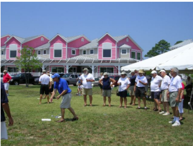
BEACH BEAN BAG TOSS